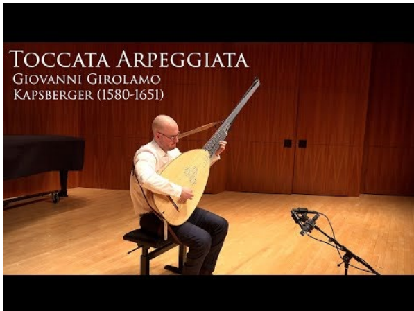
Toccata Arpeggiata by GG Kapsberger: